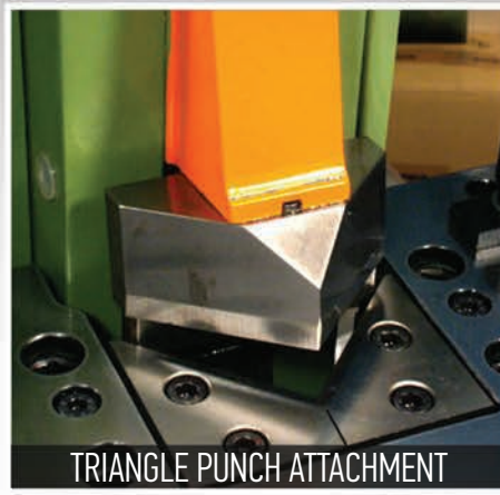
TRIANGLE PUNCH ATTACHMENT