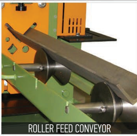
ROLLER FEED CONVEYOR