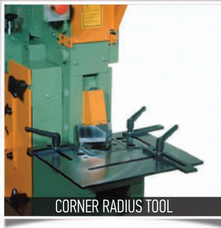
CORNER RADIUS TOOL